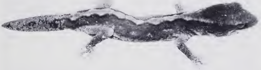
Plate 3. A Diplodactylus granariensis from the Brookton Highway 54 km ESE of Kelmscott, photographed in life by Mr T.M.S. Hanlon.

brown; pale lateral spots seldom present and never black-edged; blackish lower lateral spots often present (apparently remnants of lower margin of pale sinuous midlateral stripe); lips usually white and contrasting strongly with darker coloration of face; rest of under surface white, granules with or without a dark central dot. Towards coasts and in southern interior vertebral stripe becoming increasingly irregular and broken; pale spotting on flanks increasing; and blackish lower lateral spots disappearing.